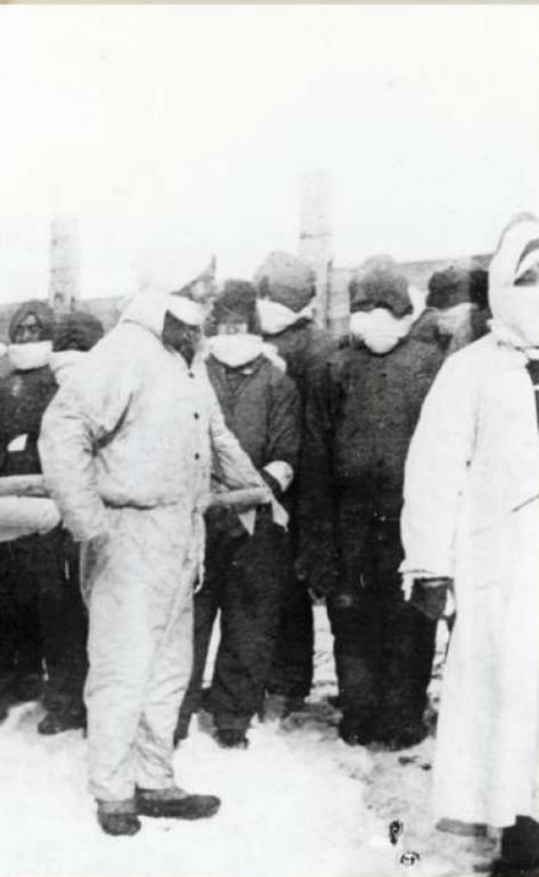
Stretcher bearers prepare to move the dead during the early 20th century plague outbreak in Manchuria.