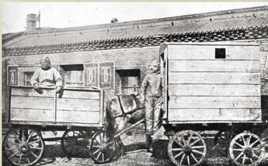
Improvised ambulances used during the 1910 pneumonic plague outbreak in Harbin. The one on the right was for the sick, the one on the left for those who had contact with them.