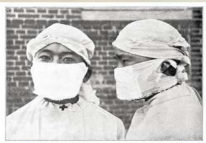
A photo shows how to wear a gauze mask during the plague outbreak.

Dr Wu managed to bring the plague epidemic to a close in three months. As for Covid-19, the end is nowhere in sight and we are still struggling to fight the pandemic. This virus hunter is humbled by the work of his uncle, Dr Wu, whom he met in Ipoh in the 50s.