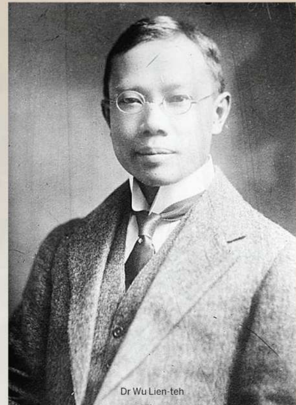
Dr Wu Lien-teh

In the UK, there is much confusion about Covid-19. Too many people are telling everyone what to do. There are too much politics, racism and other distractions. Dr Wu's public-health principles, rooted in Western medicine, remain important today. I am grateful to be able to educate my patients about these principles.