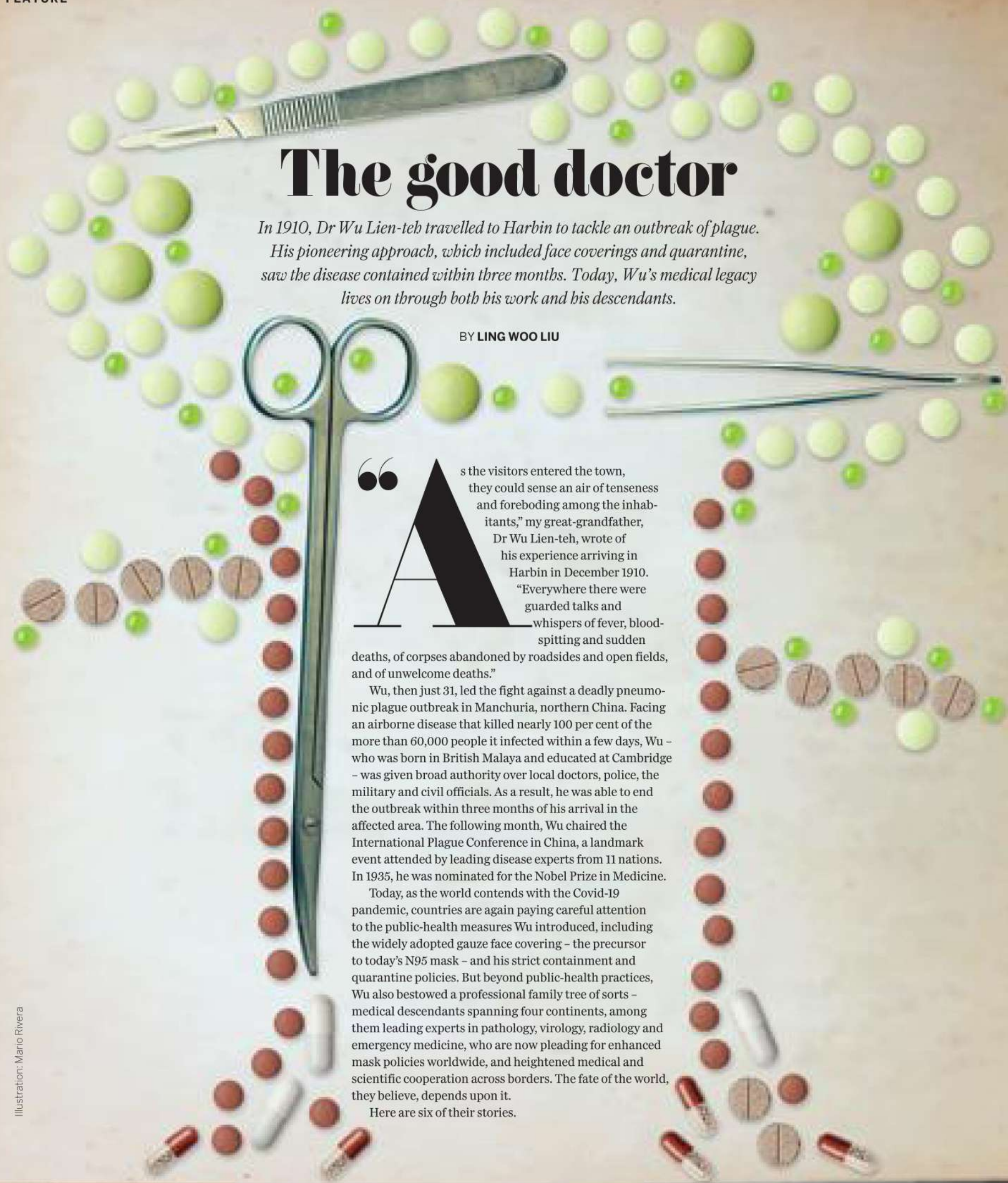
Illustration: Mario Rivera